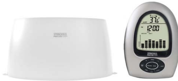
Rain Collector/Remote Sensor